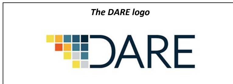
Figure 2: DARE project logo

A logo has been created for DARE which features on the website and will accompany all produced promotional material (online or offline). A few different options were prepared by NCSR Demokritos and the specific one was chosen following partner voting.