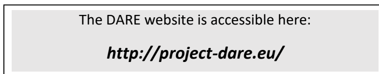
Figure 1: DARE project URL

The website has been professionally designed using WordPress, an open source CMS (Content Management System) widely adopted as a back end system for website development. It is structured in a way that allows updates as often as required, with considerably low effort, whenever new information is made available. The website uses a responsive theme that is fully customizable. The end goal is to make sure that all featured content is displayed in a user-friendly way, making it easy to navigate through its different sections and webpages. The project website is registered under the .eu domain under this URL: