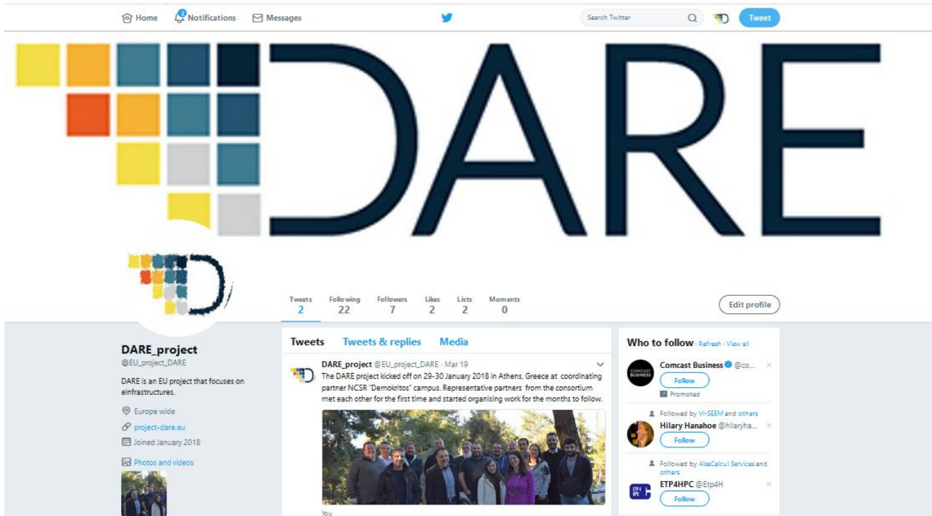
Figure 4: DARE Twitter account

DARE’s Twitter account is available under this URL: https://twitter.com/EU_project_DARE and the corresponding handle is: @EU_project_DARE